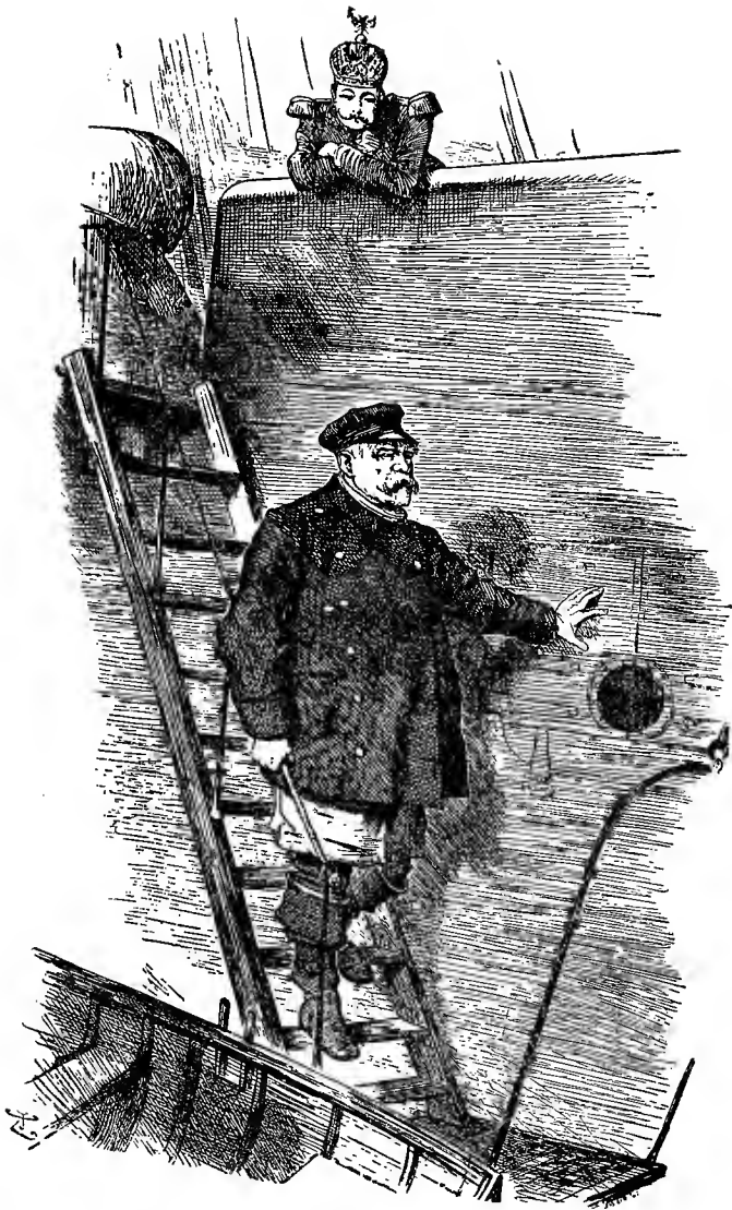
"DROPPING THE PILOT"—ONE OF THE MOST FAMOUS CARTOONS EVER DRAWN—WHICH APPEARED IN "PUNCH" MARCH 29, 1890, A WEEK AFTER BISMARCK'S DISMISSAL. WHEN THE GERMAN SHIP OF STATE CRASHED ON THE ROCKS UNDER THE UNSKILLED HELMSMANSHIP OF THE KAISER, THE CARTOONIST'S PROPHETIC CONCEPTION OF THE SIGNIFICANCE OF THE EPISODE ILLUSTRATED RECEIVED STRIKING CONFIRMATION